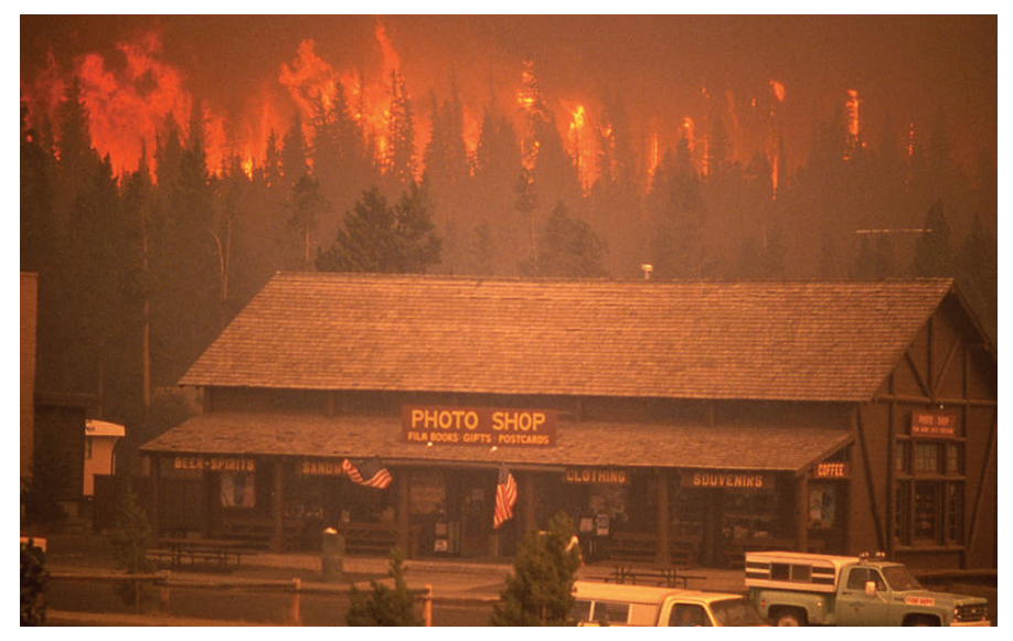
Fire approaches a gift shop in Yellowstone National Park on September 7, 1988.

Wildfires are usually driven by strong surface winds. Adding to the phenomena, a wildfire also creates its own weather atmosphere as it burns. The hot flames and gases rise rapidly from the fire and displace the relatively cooler surrounding air. This displacement leads to surface wind patterns that can blow at speeds of 70 miles per hour—near-hurricane force.